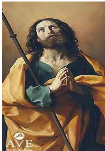
SAINT JAMES THE APOSTLE.

An eye receptacle is located in the parish hall. All eye glasses are donated to the Eye's for Needy Program who since 1932, provide over 8 million needy people in the United States and throughout the world the gift of better sight. We thank you for all your donations and support.