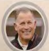
COACH GREG SCHIANO