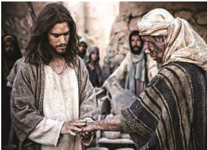
Luke 17:19 Jesus said to the leper, "Stand up and go; your faith has saved you. "

The Gospel: Luke 17: 11-19 In those days, a leper became an outcast of society. To be cured meant much more than a medical fact. It was a return to a full life. The truth that out of ten cured souls, only one returned to thank Him, the compassionate Healer, and was indeed sad. Add in that the one man who did return was a Samaritan and the folly of cultural prejudice is exposed.